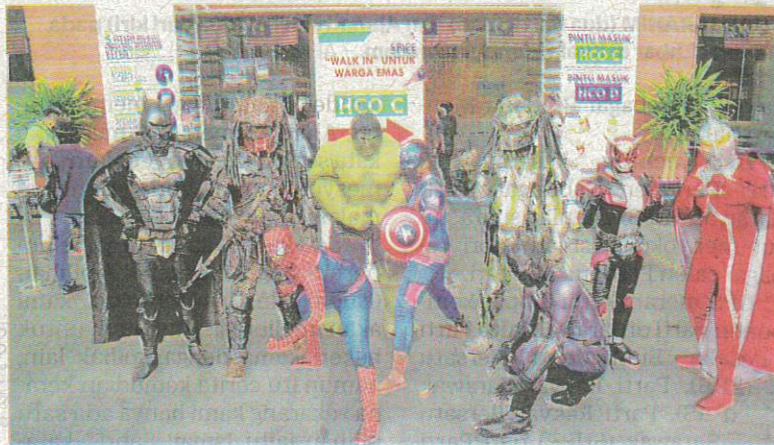
SEMBILAN individu mengenakan kostum adiwira hadir memberi sokongan kepada penerima vaksin di Pusat Pemberian Vaksin Spice Arena, Bayan Baru, Pulau Pinang semalam.

“Manakala sebanyak 21,812 kes (98.1 peratus) lagi adalah ter-