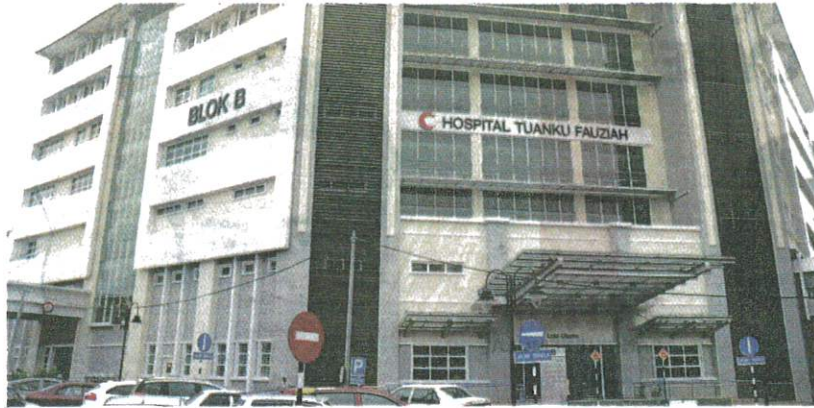
PENGUNAAN katil bagi pesakit Covid-19 di PKRC di Hospital Tuanku Fauziah, Kangar, Perlis sudah mencapai 101.5 peratus.

Menurut beliau, penggunaan katil di Pusat Kuarantin dan Rawatan Covid-19 (PKRC) di Institut Latihan Kementerian Kesihatan Malaysia (ILKKM) Kangar pula pada tahap 80.7 per-