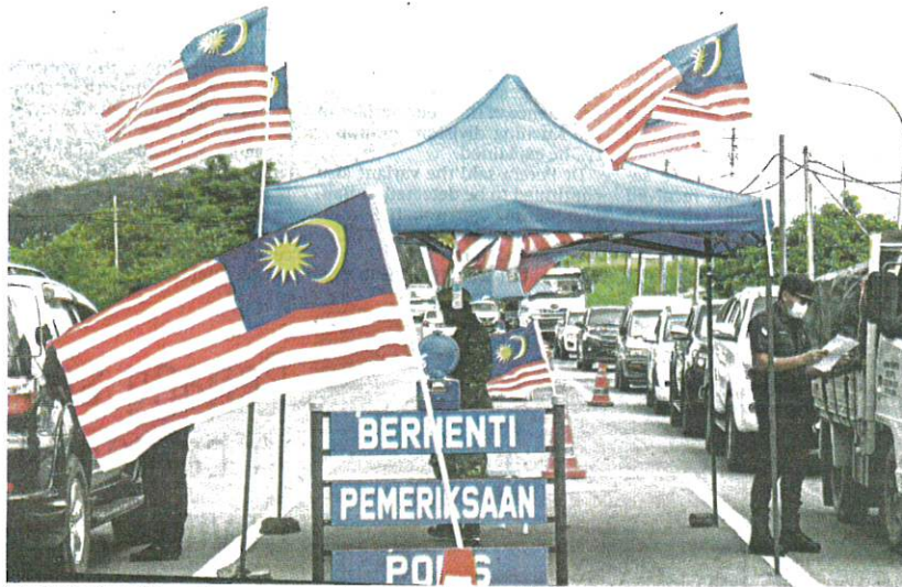
The Jalur Gemilang adorn a canopy set up at a police roadblock in Jalan Papar Lama, Kota Kinabalu, on Tuesday.

A total of 225 deaths were recorded yesterday, with 35 (eight foreigners and 27 Malaysians) or 15.5 per cent of total fatalities brought in dead (B.I.D.).