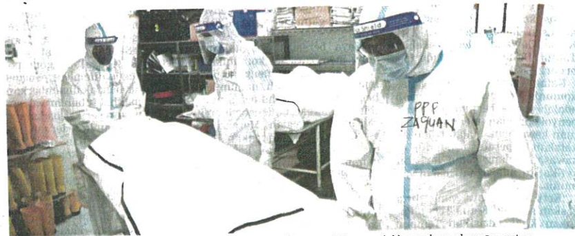
Analisis data klinikal angka kematian akibat COVID-19 di negara ini menunjukkan sebanyak 0.03 peratus membabitkan individu yang menerima dos penuh.

"Kita menggunakan kaedah AI yang diperkenalkan beberapa bulan lalu, individu yang mendapat notifikasi sebagai Kontak Kasual ini adalah disebabkan dia dikesan terdedah dengan mana-mana kes positif COVID-19 di negara ini," katanya.