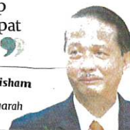
Dr Noor Hisham Abdullah, Ketua Pengarah Kesihatan

Sabah (18), Pulau Pinang (15), Kedah (14), Perak (9), Negeri Sembilan (8), Melaka (7), masing-masing enam kes di Kelantan dan Pahang, manakala Terengganu (5) dan Sarawak (2).